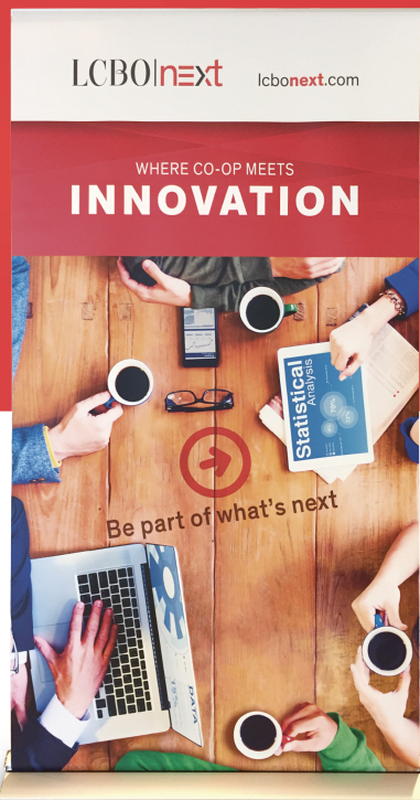
1 - Unit Banner Display