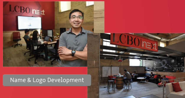
Name & Logo Development